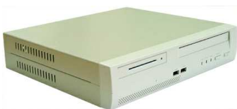
Figure 1 Information PC

The Information PC reference design is a small, quiet and inexpensive entry-level computing platform spanning price points from US$199 to US$399. It is optimised for mainstream Internet applications and services as well as common productivity, education, storage and entertainment applications. The Information PC is fully compatible with standard x86 hardware and software, thus offering the advantage of flexibility, connectivity, upgradeability and, with the VIA C3™ processor, quiet operation.