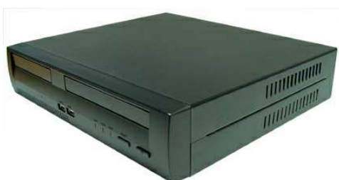
Figure 2 Information Station

The Information Station reference design provides a small, silent and affordable platform for devices that convert a television into an interactive multimedia box capable of surfing the web, playing DVDs and running common productivity applications.